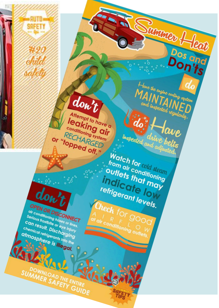
Example Social Media Campaign Assets

Infants and young children should never ride in the front seat of a vehicle with a passenger air bag.